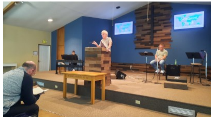
Sharing about Bible Translation in Indiana

Thank you again for being a part of this ministry. People everywhere have many needs, but the Word of God is what points the way to eternal life.