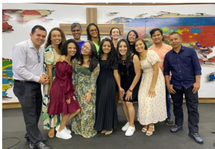
Graduating Class from Linguistics Course

This is why this newsletter is coming out a bit late. I really needed to include this bit of news.