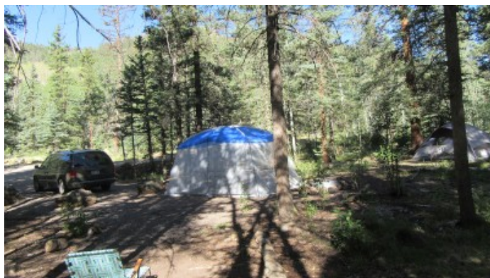
One of my temporary homes on the road

So please keep "spreading the word" about both of these needs! There is a required notice at the end saying not to distribute this letter without permission, but there is nothing sensitive here. So you have permission! Feel free to distribute it to anyone you want to—with my gratitude.